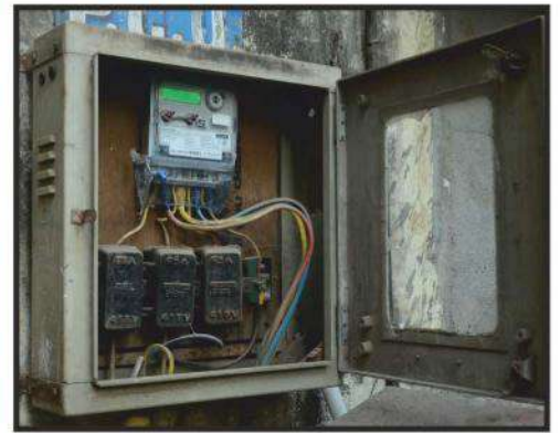
Safety & Theft Issues from Feeder Pillars